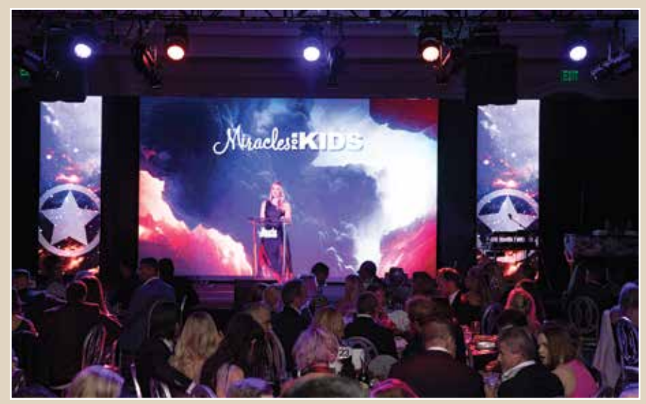
This inspirational evening was hosted at the Waldorf Astoria Monarch Beach Resort and brought together reallife heroes and miracle makers at the 18th Annual Miracles for Kids Night of Miracles Gala with a vital mission: to secure crucial funds for families with children battling life-threatening illnesses and conditions. The 'Marvelous Miracles' evening was inspired by Marvel's legendary heroes.

Irvine-based nonprofit, Miracles for Kids held the 18th Annual Night of Miracles Gala, bringing together over 450 guests whose extraordinary generosity helped raise nearly $3.5 million to benefit over 350 critically-ill children and families in extreme crisis. Thanks to 30+ sponsors & underwriters and 200+ volunteers, the evening was an inspiration to all who attended.