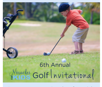
Sponsor our Miracles for Kids Golf Invitational