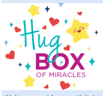
Help us provide essentials to families in need

Miracles for Kids Golf Invitational Sponsor