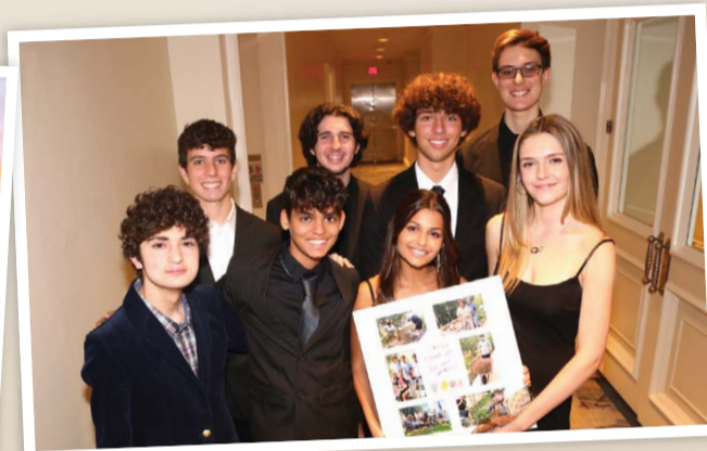
The Children's Wellness Garden Club, consisting of a group of high school students, was named this year's Champion of Children Honoree, for generously providing 250+ volunteer hours to transform Miracles for Kids' outdoor area into a Certified Wildlife Habitat for children and families to enjoy during therapy and social skills sessions.