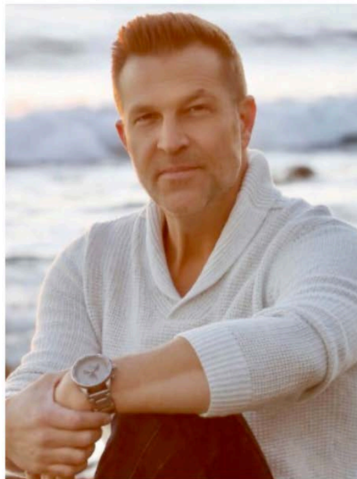
Click on photo for a larger image